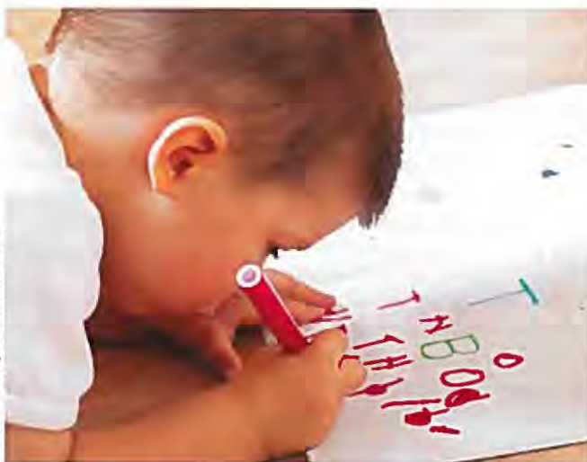
Repeated practice allows skills to become second nature or automatic.

must inhibit acting out of character, hold in mind the role they have chosen and those of their friends, and flexibly adjust in real time as their friends take the play scenario in directions they never imagined. Thus, social pretend play exercises and challenges all three core executive functions.