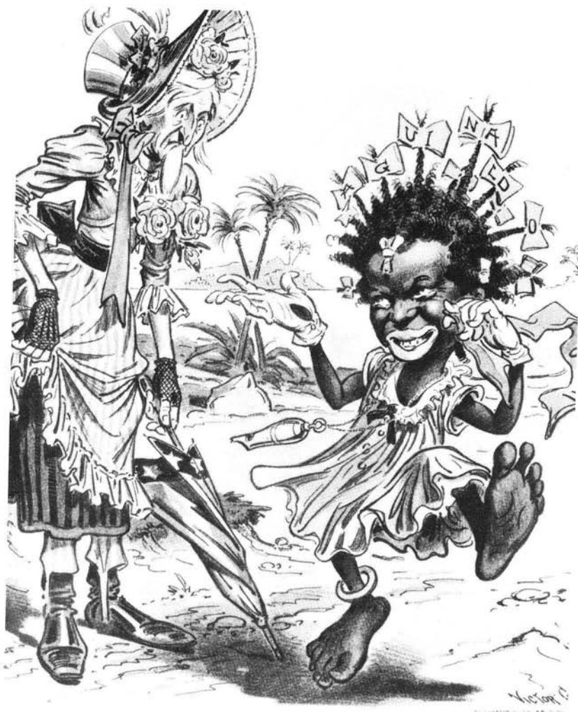
'Niggering' as part of the imagery of imperialism. General Emilio Aguinaldo (1869-1964), leader of the Philippine resistance to American colonialism after 1898, presented as a black dancing girl, with a stupefied Uncle Sam as a white old lady.

against that of the Chinese here.' Heathen, morally inferior, savage, and childlike, the Chinese were also viewed as lustful and sensual. Chinese women were condemned as a 'depraved class' and their depravity was associated with their almost African-like physical appearance. While their complexions approached 'fair', one writer observed, their whole physiognomy indicated 'but a slight removal from the African race'. Chinese men were denounced as threats to white women. . . . 17