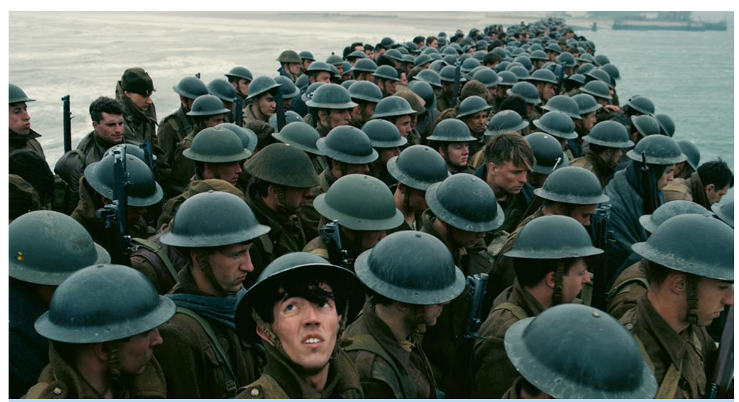
Film still from "Dunkirk"

hardworking Britons knew and recognised how much of their lives, safety and prosperity are results of non-British sacrifices? In a <u>deeply divided</u>, <u>fearful Britain</u>, Nolan's directorial choices succeed as a Brexiteer costume fantasy, but they fail to tell the story of Operation Dynamo, the war, and Britain. More importantly, they fail us all, as people and a nation.