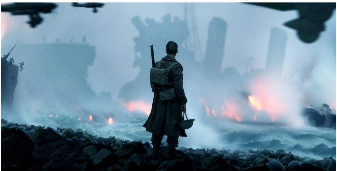
Film still from "Dunkirk"

important that the covering fire be provided by white French troops rather than North African and Middle Eastern ones? Those non-white faces I mentioned earlier – they were French troops scrabbling to board British boats to escape. The echoes of modern politics are easy to see in the British-first policy of the initial retreat that left French troops at the mercy of the Nazis. In reality, non-white troops were at the back of the queue for evacuation, and far more likely to be caught and murdered by Nazi soldiers than their white colleagues who were able to blend into the